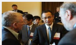
Honorifics omitted from the left: Paul Berg, Shinya Yamanaka, Irving Weissman