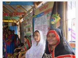
Nutrition education implementation scene in Bangladesh