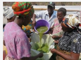
"Spirulina" cultivation landscape in Zambia