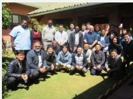
Global Leadership Programme with the Government of Zambia